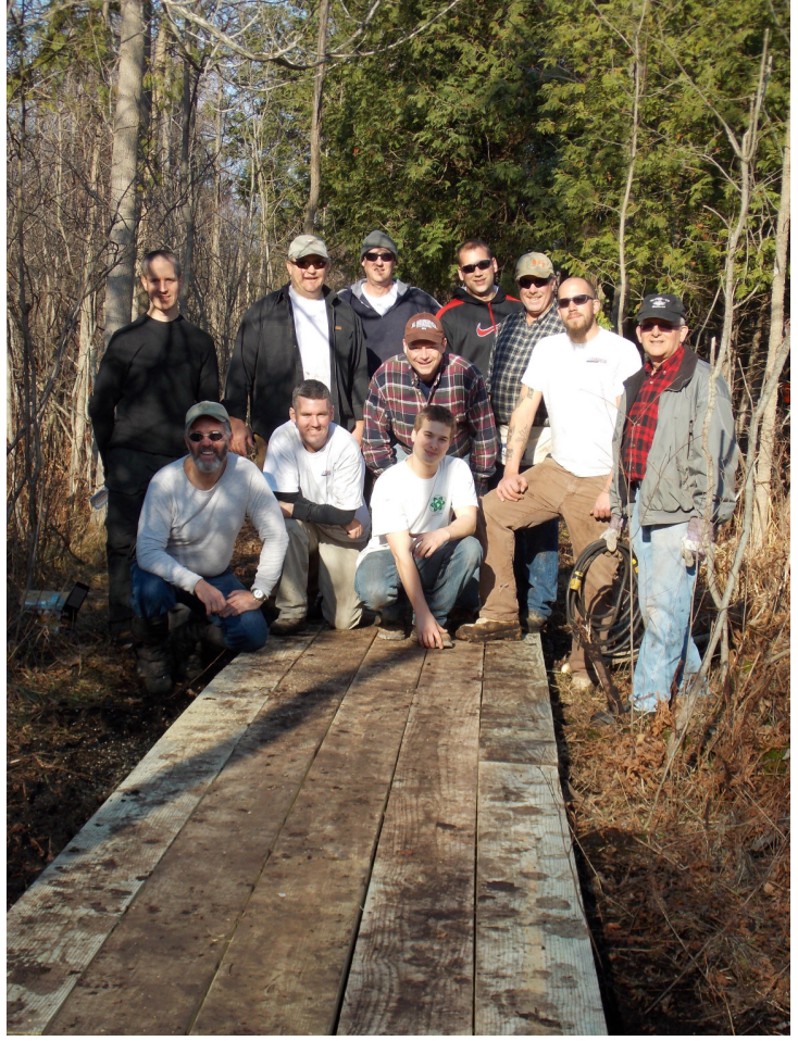
This was about half of the volunteers who helped build the boardwalk.